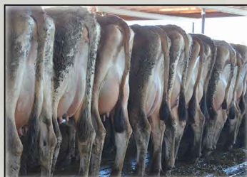
2 GROUPS OF 20 - 1ST LACTATION COWS Video at http://vimeo.com/85800415 (Group 1) Video at http://vimeo.com/85799743 (Group 2) Consigned by Phil Fanelli & Family, Hilmar, CA