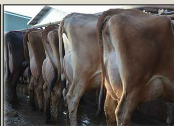
24 - 1ST, 2ND LACTATION COWS Video at http://vimeo.com/85580324 Consigned by Wickstrom Jersey Farm, Hilmar, CA