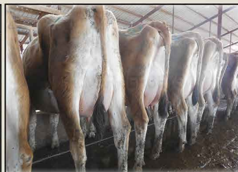
2 GROUPS OF 25 - 1ST LACTATION COWS Video at http://vimeo.com/85888772 (Group 1) Video at http://vimeo.com/85888771 (Group 2) Consigned by Hilmar Jerseys, Hilmar, CA

JER-Z-BOYZ, PIXLEY, CA Will be consigning 50 head of 1st and 2nd lactation cows. The selection of cattle and their video will be available after Monday, February 10.