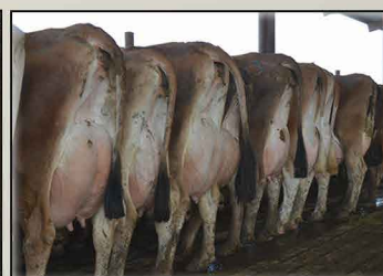
30 - 1ST, 2ND LACTATION COWS Video at http://vimeo.com/85577887 Consigned by Red Top Jerseys, Hilmar, CA